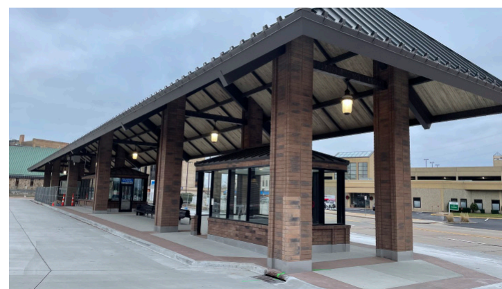
Downtown Transit Center (110 Pearl Avenue)